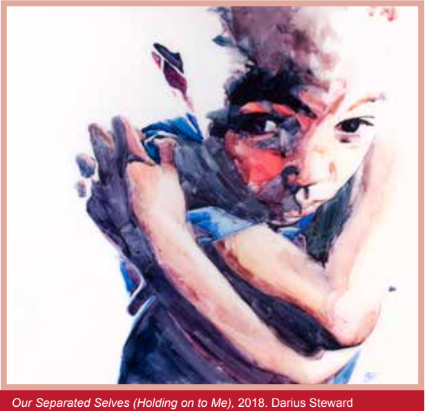
(American, b.1984). Watercolor on Yupo paper, 24 x 24 in.

watercolor painting and ceramics. In the 1920s, Cleveland's position as the center for American watercolor painting and its strong connection with commercial and fine art ceramics, helped to define what is commonly known as the "Cleveland School" of artists – an artistic movement that can be traced back to the 1870s.