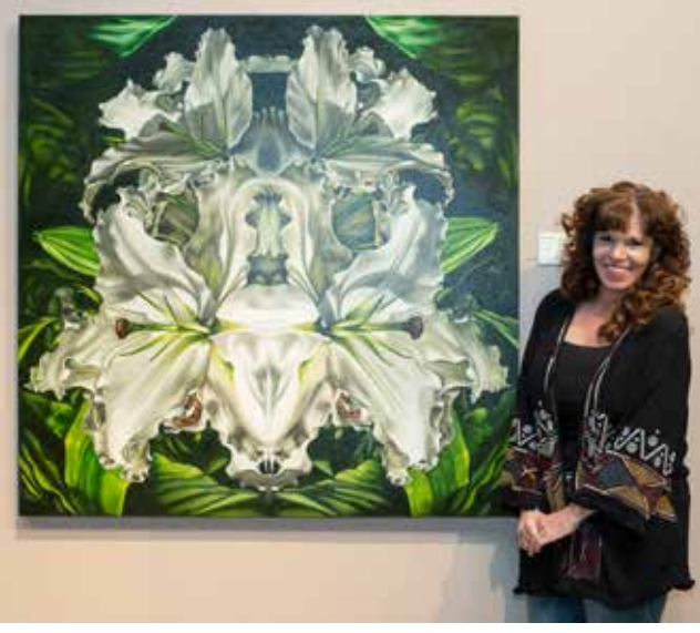
Moonlit, Oil on Canvas