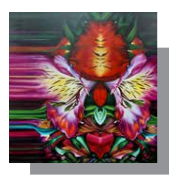
Gypsy, Oil on Canvas