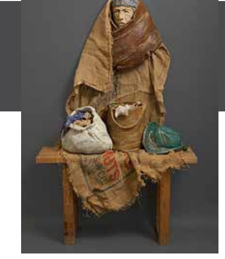
(top center) Address Unknown, 1989. Susan Grabel (American, b. 1942). Ceramic and wood. 19 x 48 x 24 in. Canton Museum of Art Permanent Collection, Gift of Susan Grabel, 2023.26.

(above) Once Upon A Time, 1989. Susan Grabel (American, b. 1942). Ceramic, wood, and burlap. 63 x 48 x 14 in. Canton Museum of Art Permanent Collection, Gift of Susan Grabel, 2023.27.