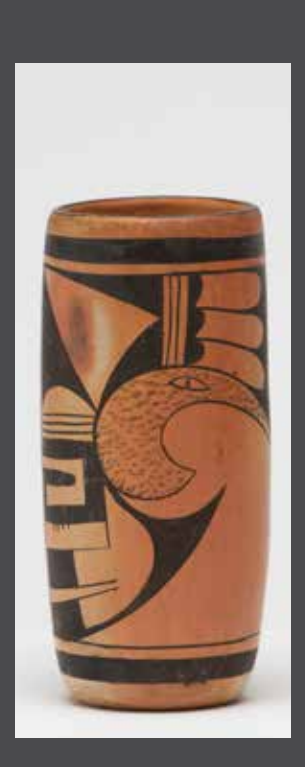
Untitled, n.d. Unknown Hopi Artist. Ceramic, 4 x 4 x 9 <sup>1</sup>/<sub>2</sub> in. Canton Museum of Art Permanent Collection, Gift of Warren McCullough in memory of Marjorie McCullough, 2023.11.