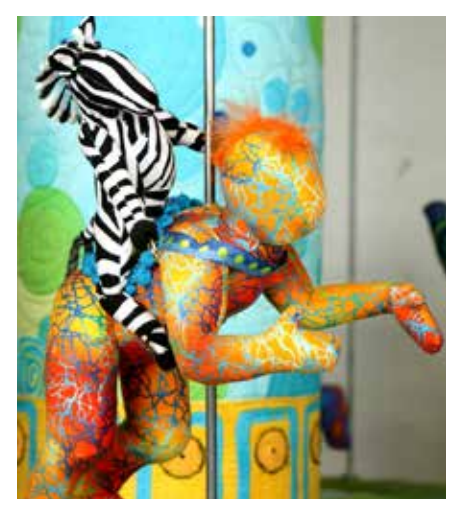
When Ponies Dream (detail), 2013. Susan Else. Collaged and quilted cloth over armature, motorized with lights and audio, 31 x 41 x 31 in.