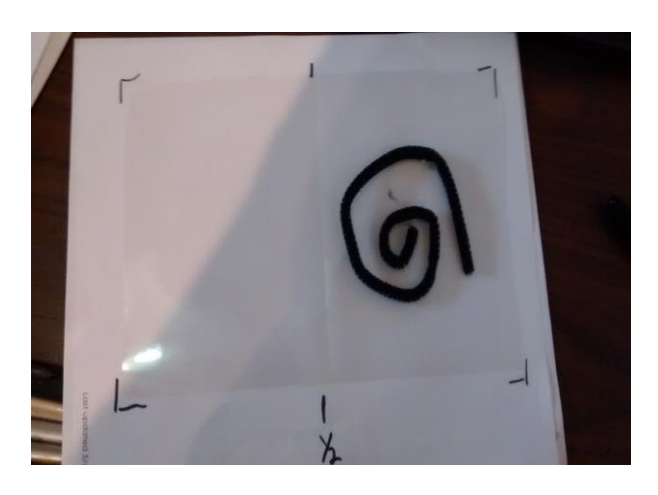
Step 2: Second pipe clear is placed in circle around coiled piper cleaner.

Step 1: Pipe cleaner is coiled and placed on ½ of laminate sheet.